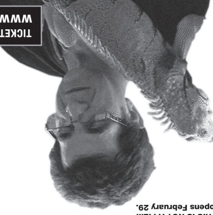
THIS IS NOT A FILM opens February 29.

TICKETS AVAILABLE ONLINE & AT BOX OFFICE www.filmforum.org 7 DAYS IN ADVANCE