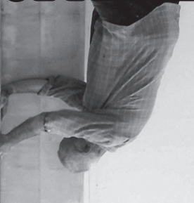
GERHARD RICHTER PAINTING opens March 14.

TICKETS AVAILABLE ONLINE & AT BOX OFFICE www.filmforum.org 7 DAYS IN ADVANCE